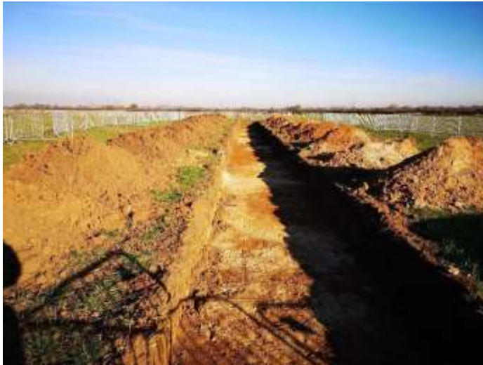
Figure 4.4: Soil pattern

Source: Mott MacDonald, November 2021 Soil