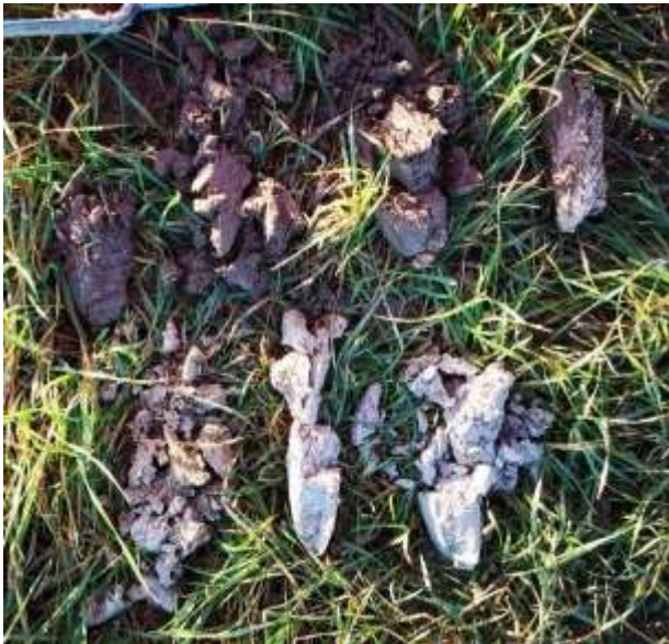
Figure 4.1: Soil Type 1 – Shallow calcareous loam

4.1.1 The soils are generally well drained, calcareous soils with few to common flints at various depths. Three major soil types were identified in the survey (Figure 6.4 Book of Figures- Agricultural Land and Soils (App Doc Ref 5.3.6)). Soil type 1 is shallow, very calcareous loam over chalk, chalk rubble or chalk drift (Figure 4.1). Soil type 2 is very calcareous deep loam (Figure 4.2). Soil type 3 is very calcareous deep soil with loam over loamy sand or sand (Figure 4.3). The soils over the proposed WWTP vary within distance. Figure 4.4 indicates the frequent variation and complex pattern of the soils. Detailed auger borehole data are in Appendix A.2.