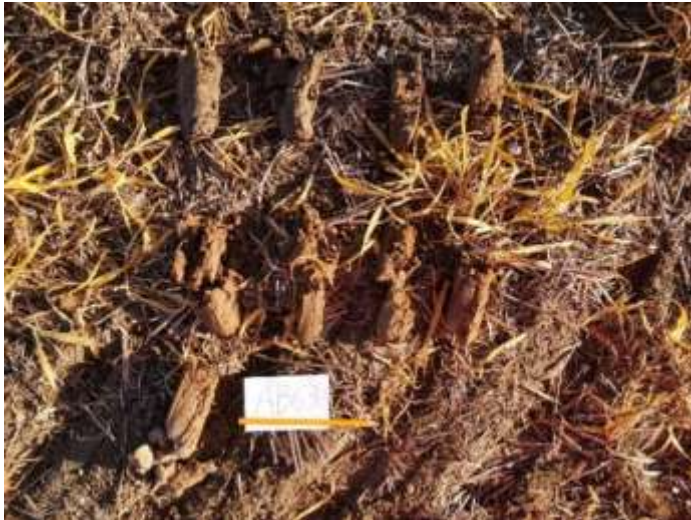
Figure 4.2: Soil Type 2 – Deep calcareous loam