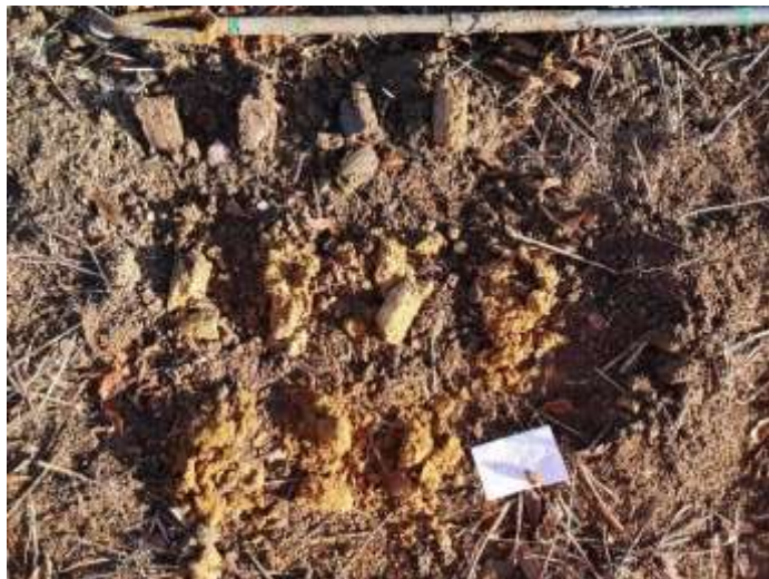
Figure 4.3: Soil Type 3 – Calcareous loam over loamy sand or sand